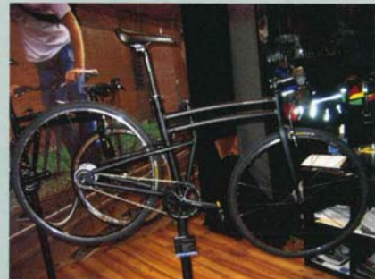
Montague Boston 8

The clean single-speed design of the Boston bikes appeals to multimodal commuters who like the ease of trunk loading and taking the simple